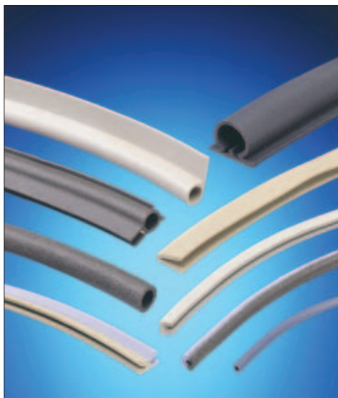
Figure 5: Examples of extruded elastomers

The major advantages of conductive elastomers are their high shielding performance over a range of frequencies and their environmental sealing capabilities. Potential corrosion problems in outdoor applications can be overcome using specially treated fillers or by using a co-extrusion which combines a