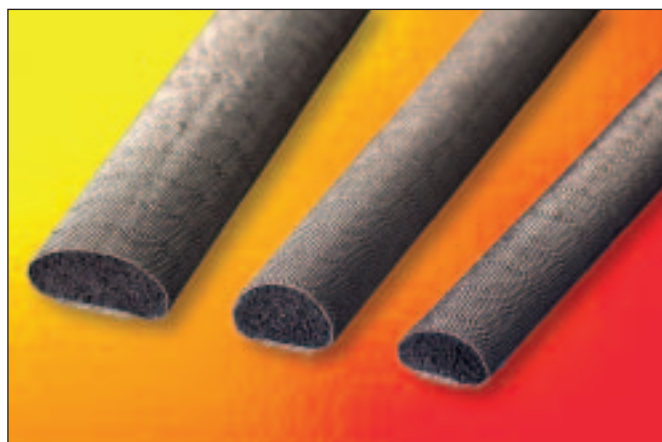
Figure 1: Some examples of fabric-over-foam gaskets

Advantages of fabric-over-foam gaskets are their lower price compared to elastomer or fingerstock gaskets, ease of use, variety of profiles, air sealing capability, and softness. Most fabric-over-foam gaskets now come with UL94-V0 flammability rating options. Disadvantages can be compression set, (depending on the foam used), and