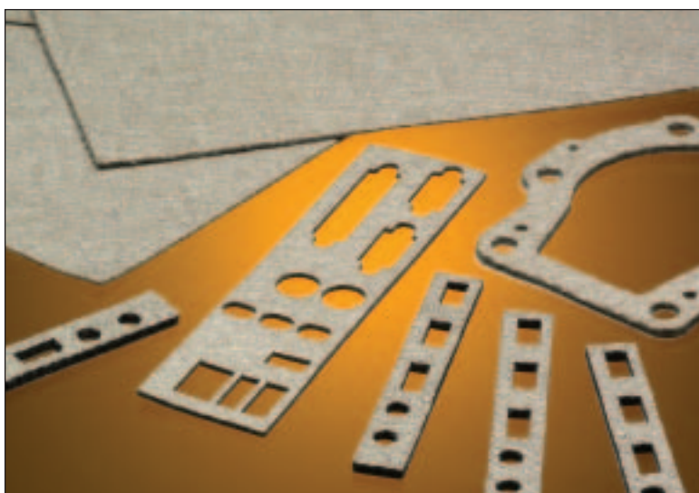
Figure 2: An example of die-cut z-axis foam gasketing