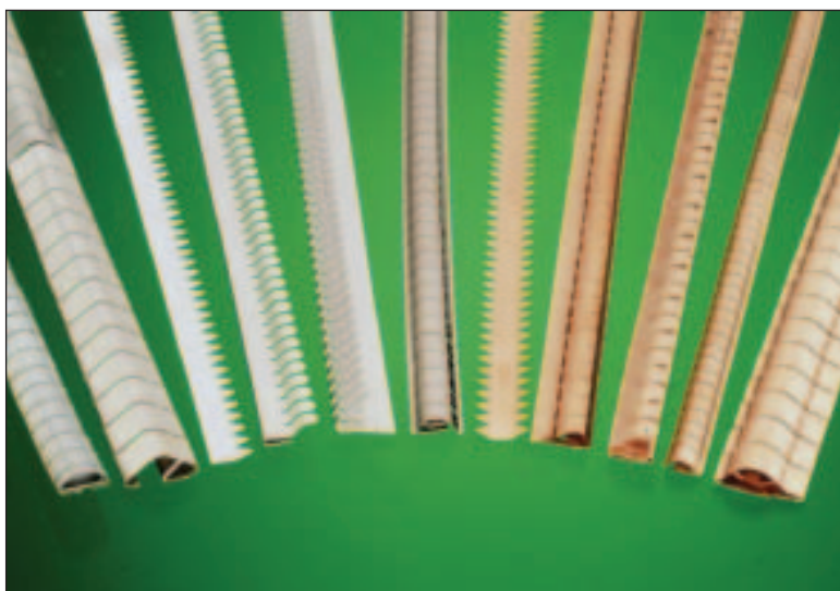
Figure 3: A variety of fingerstock materials are available